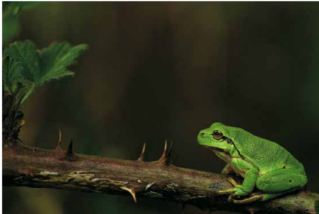
▲ The European tree frog ( Hyla arborea ) is a small frog that can grow to a maximum length of 4.5cm and Peter Lambrichs used his macro lens to really pick out the detail of the frog's skin and the protruding thorns. This was taken using a Pentax K10D with a Tamron AF SP 90mm f/2.8 DI Macro lens.