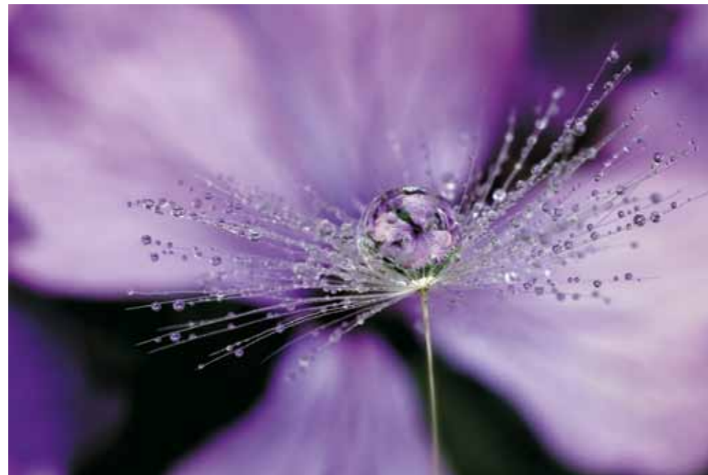
▼ The close up of the Dandelion seed with the tiny water drops hanging off it is great, but to have a large waterdrop in the centre of it, with a reflection of an Honesty flower on it makes the image that bit more special. Gary Hickin did a great job.